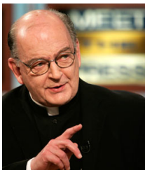
Richard John Neuhaus

“23 Let us hold fast the confession of our hope without wavering, . . . 24 and let us consider how to stimulate one another to love and good deeds, 25 . . . encouraging one another; and all the more, as you see the day drawing near.”